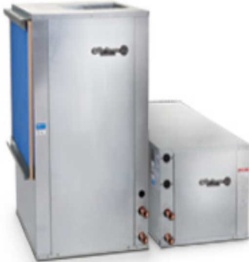
WaterFurnace Water Source Heat Pump For more information, click here .