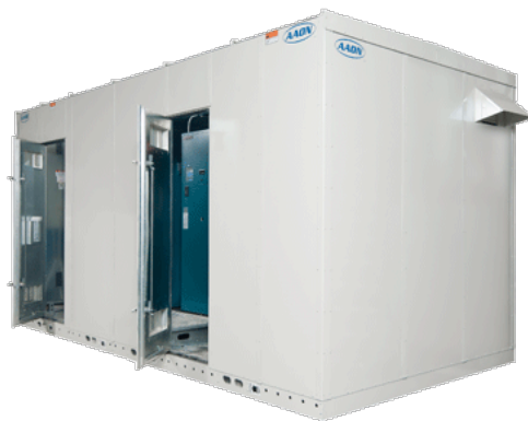
Aaon's Boiler Plant For more information, click here .