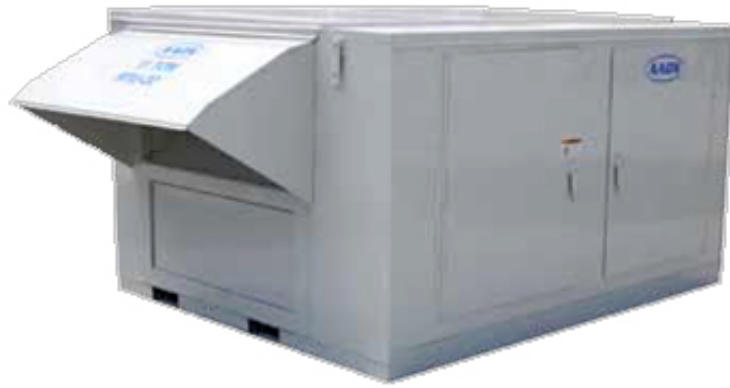
Aon's Rooftop WaterSource Heat Pump for the Buildings Corridor Make Up Air For more information, click here .