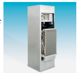
Vertical - Closetline Classic Water Source/ Geothermal Heat Pump/Air Conditioner