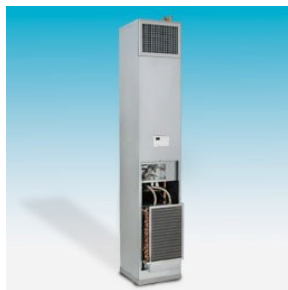
Vertical Stack - Whisperline Classic Water Source/ Geothermal Heat Pump/Air Conditioner

Revit® drawings for the complete Water Source Heat Pump family, including: